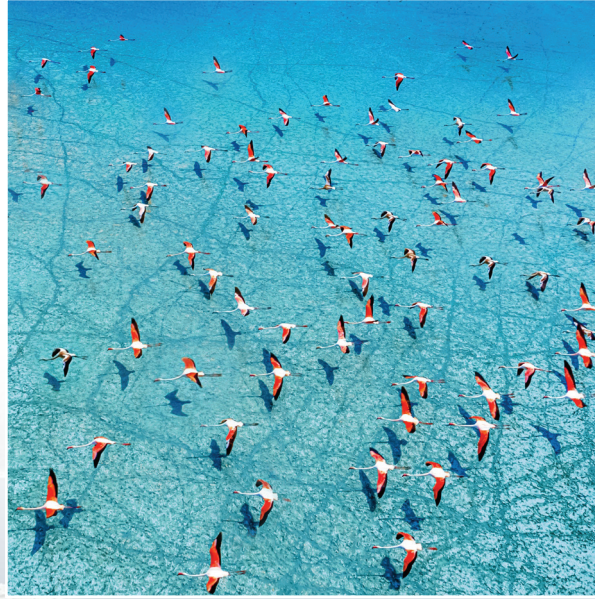
Yarışlı Lake is on the migration route of flamingos.

Yeşilova is one of the important tourism centers of the region. Salda Ski Center, Salda Lake, Yarışlı Lake, Ak Lake are the main attractions. Yeşilova is on the migration route of flamingos. Salda Lake and Salda Ski Center are visited by hundreds of thousands of people every year. Numerous public and private sector amenities in the region are at the service of visitors throughout the year.