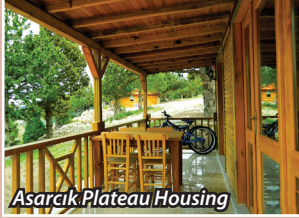
Asarcık Plateau Housing