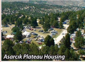
Asarcık Plateau Housing