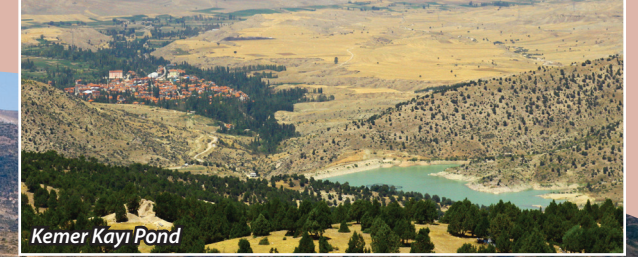
Kemer Kayı Pond