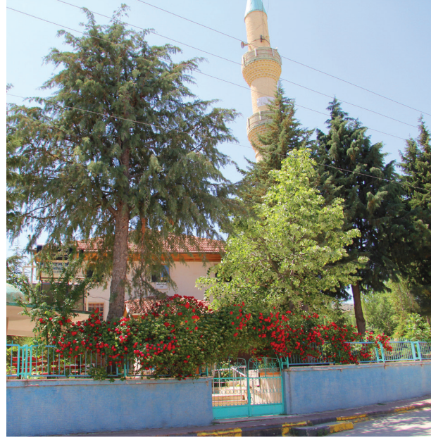
Historic Merkez Yukarı Mosque, exceptional with its wooden hand-drawn decorations.