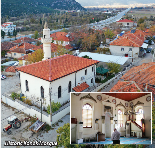
Historic Konak Mosque

Çeltikçi was founded in 1725's. With the settlement of a family of Koklan Beys in this region, the first foundations of the present Konak District were laid. In the following years it was named Çeltikçi due to the cultivation of rice in the region, as 'rice' means 'çeltik' in Turkish. A municipality was established in 1968 due to the increase in population. With the law enacted in 1990 Çeltikçi became a district. It currently has 4,974 inhabitants.