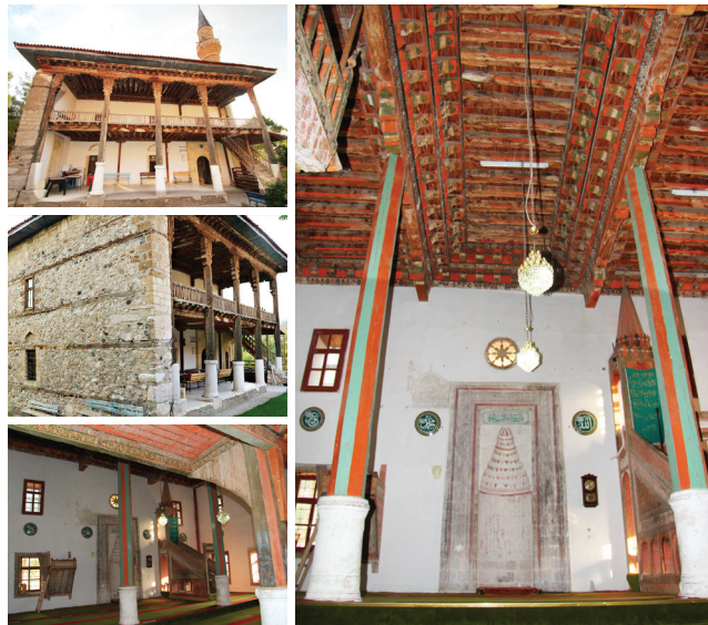
The historical Dengere Mosque located in Bölmeşinar village of Çavdır is one of the art works of the Ottoman Period. It carries the deep traces of history to present with its qualified woodwork.