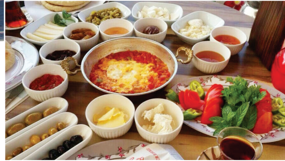
There are many facilities in Çavdır which welcomes its visitors with delicious breakfasts.

The mosque in Bölmeşinar (Dengere) village is a leading component of the historical and cultural heritage of the region, although the date of construction is unknown.