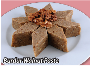
Burdur Walnut Paste