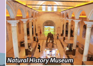
Natural History Museum