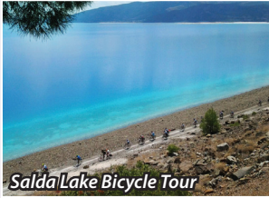
Salda Lake Bicycle Tour