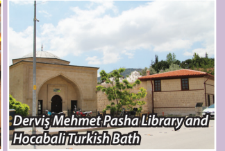
Derviş Mehmet Pasha Library and Hocabali Turkish Bath