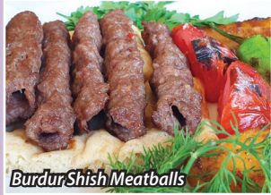
Burdur Shish Meatballs

Burdur Shish Meatballs and Burdur Walnut Paste, which are made with the methods specific to the region, are the products having geographical indication. In addition, many products obtained from medicinal and aromatic plants, especially rose and lavender, are offered to you under the Burdur brand. Handcrafted woolen carpets and kilims and a variety of famous Alaca weaves fascinate those who see them. There are many facilities serving their guests throughout the year in Burdur and its surroundings where you can experience the values unique to the region.