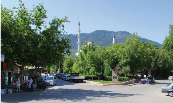
Altinyayla city center.

Altinyayla, formerly named as Dirmil, became a municipality in 1955 and a district in 1990. Current population is 5,422.