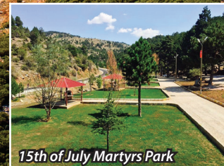
15th of July Martyrs Park