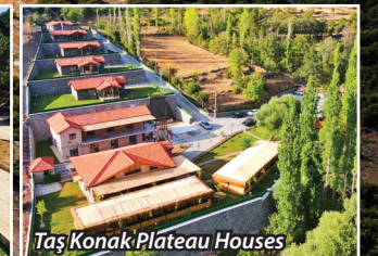
Taş Konak Plateau Houses