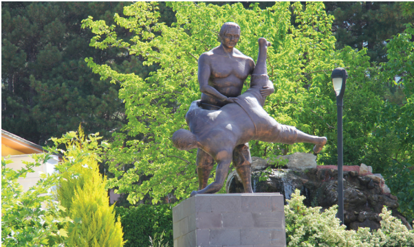
Altinyayla is one of the charming districts of the region with its traditional sports and colorful folklore.